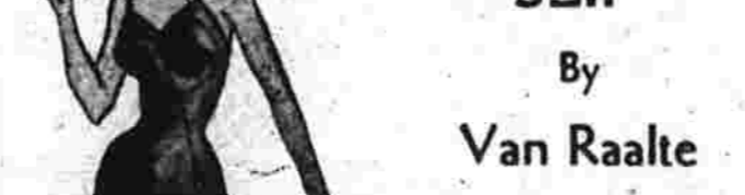
SLIP By Van Raalte Designed in princess lines. Comes in two styles, plain or with a contrasting top and bottom.