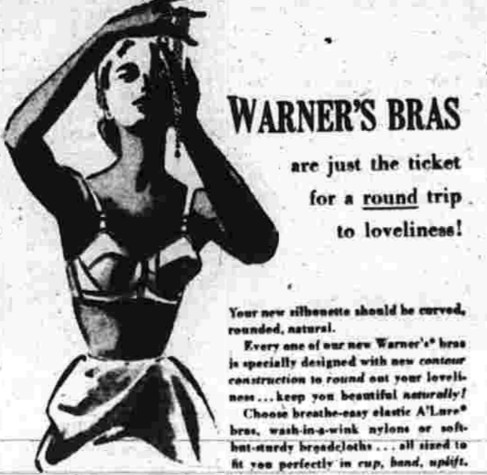
Warner's Bras are just the ticket for a round trip to loveliness! Year new silhouette should be curved, rounded, natural.